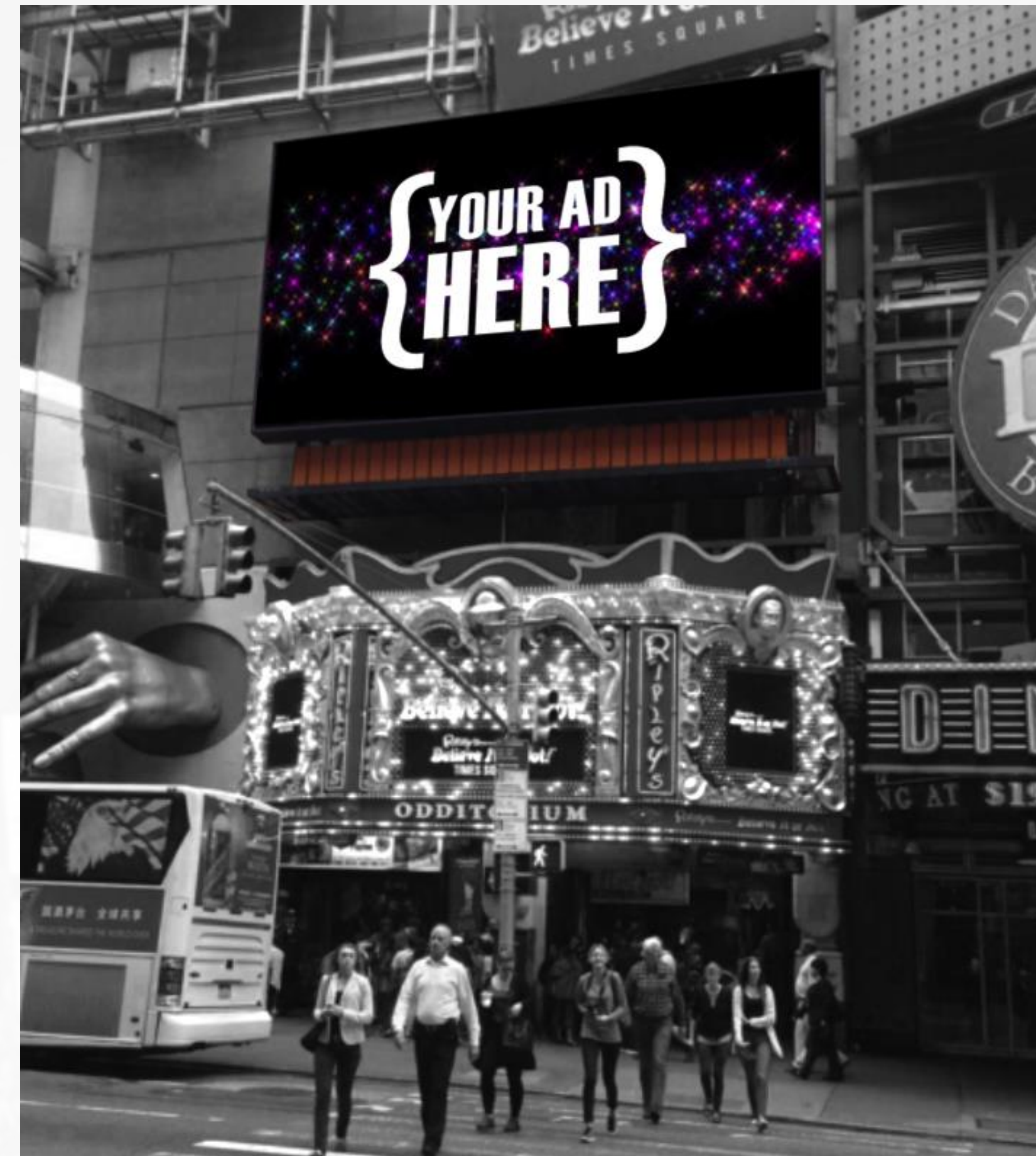
42 nd Street View

The unit measurements are 19' 0" H x 34' 0" W And support all digital media creative assets, including HD.