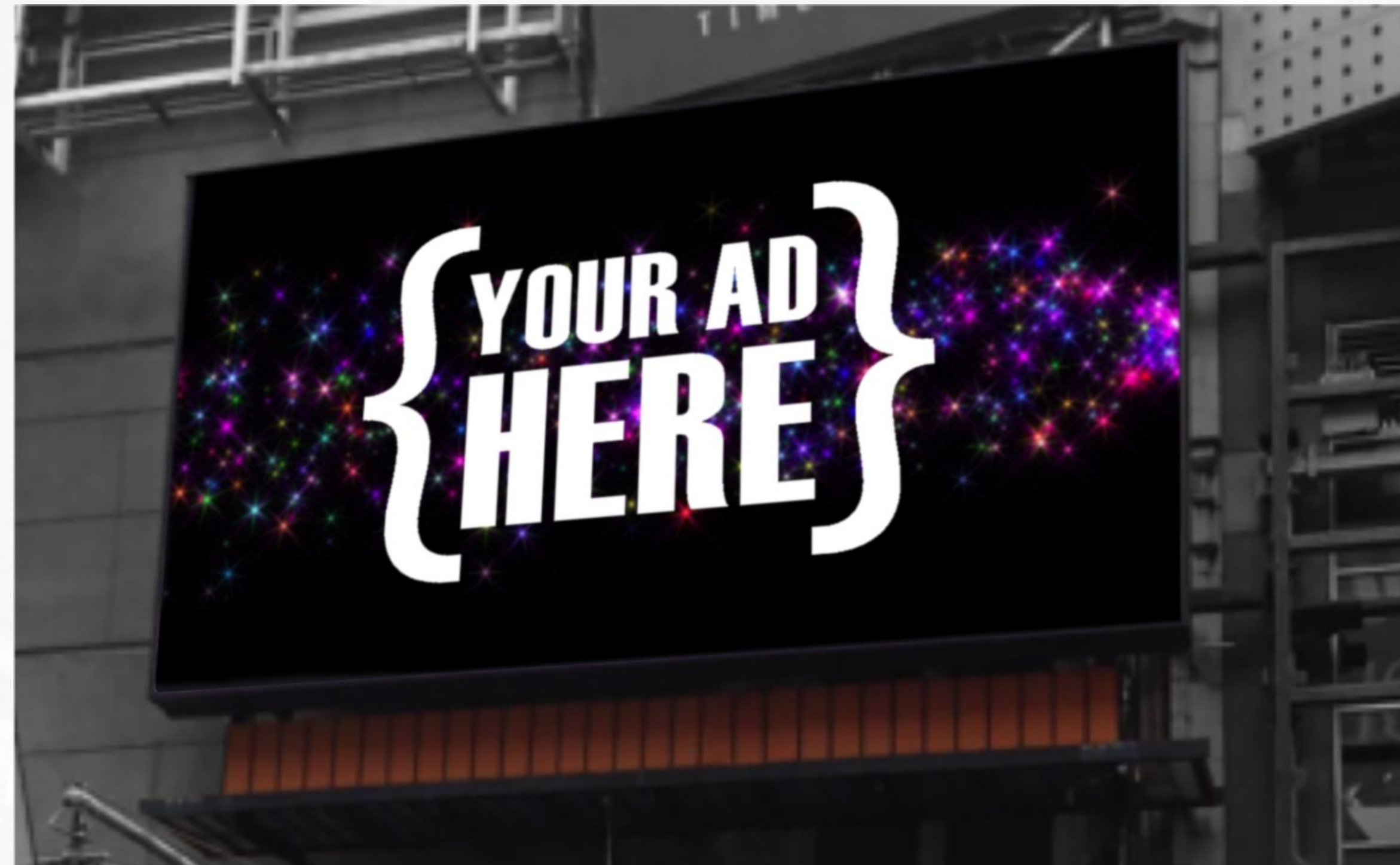
7 th Avenue View

This traffic is made up of people going to two of the country's largest grossing movie theaters: The AMC Empire 25 and the Regal E-Walk Stadium 13. Additional attractions in the area include The New Amsterdam Theater, Madame Tussauds, The New Victory Theater, Modell's Sports, Sketchers, Ann Taylor Loft, Quicksilver and Champs Sports.